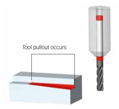
Length alterations can lead to damage of the workpiece.