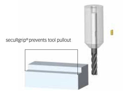
Prevent workpiece damage by using REGO-FIX secuRgrip®.